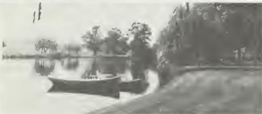
(Left) VAL-KILL POND. ELEANOR ROOSEVELT NATIONAL HISTORIC SITE, HYDE PARK, NEW YORK. This pond, created in 1926 on the site of Eleanor Roosevelt's home, is an example of a historic landscape associated with someone of national significance. The pond is part of one of the most recent additions to the National Park System.