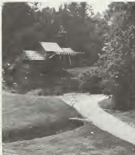
MABRY MILL. BLUE RIDGE PARKWAY, NORTH CAROLINA-VIRGINIA. This mill, in an area whose land-use patterns date to the 1700's, is a good example of a type of cultural impact upon the landscape. Also extant within this area are log cabins; all dating from the same period.

The author is a Historical Landscape Architect, presently on leave from his faculty position in the Department of Landscape Architecture, Kansas State University. He is working with the Chief Historical Architect, National Park Service, on identification and evaluation procedures for cultural and historic landscapes in the National Parks. He is also a member of the Alliance for Historic Landscape Preservation.