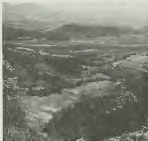
(Right) BLUE RIDGE PARKWAY, VIRGINIA. Shown is a view east from the Parkway over the Piedmont area. This parkway was designed as much for its scenic views as for its other qualities. The farming patterns of this valley contribute to the cultural landscape of the area. (1938 photo)