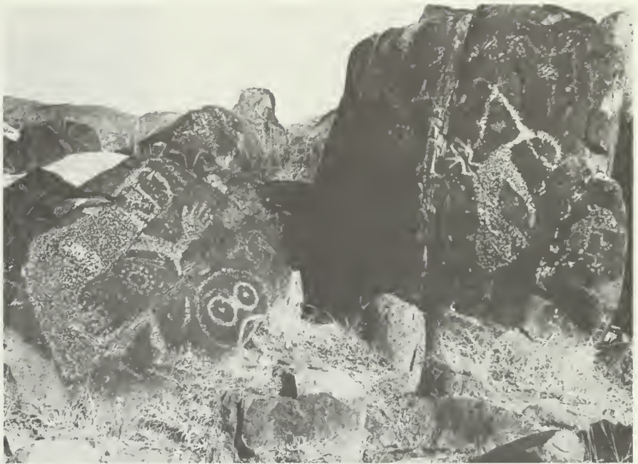
Petroglyph panels at Three Rivers State Park, New Mexico.

Interpretation efforts have also been hampered by a lack of academic agreement on the importance and meaning of the prehistoric symbols, and in some cases historic depictions, grouped under the rubric of "rock art." Some scholars regard petroglyphs and pictographs as a form of information storage, while another group views them as artistic products within a local or regional cultural tradition. Matters have been made still worse by the long-standing disinclination of professional archeologists to get involved in the study.