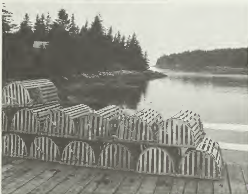
(Left) ACADIA NATIONAL PARK, MAINE. Consisting of more than 11,000 acres, Acadia National Park represents and expresses the point of interface between the natural landscape of the rocky, island coast of Maine, and the encroaching cultural landscape of the lobstering and fishing industries. The edge of the Park is interwoven with the surrounding cultural landscape, and the artifacts associated with its exhibited values and land use patterns.