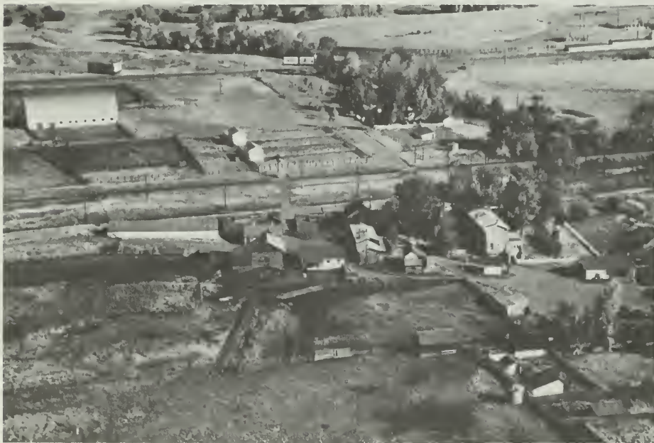
(Above) GRANT-KOHR'S RANCH NATIONAL HISTORIC SITE, MONTANA. This typical western ranchstead of the last century is owned and maintained by the Park Service in its entirety, including furnishings and farm equipment. It is a fine example of settlement and layout patterns representing a continuum of over 100 years.