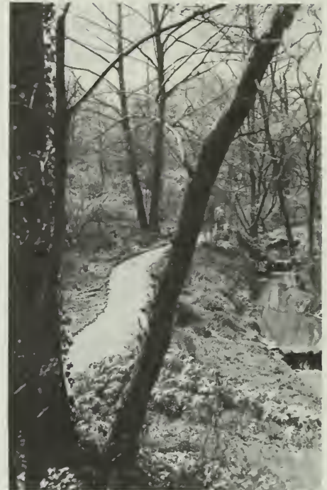
(Above) DUMBARTON OAKS PARK, WASHINGTON, D.C. This park, designed by Beatrix Jones Farrand, lies adjacent to private lands. The informal walkway and the small ponds and waterfalls created by the dams lend this historic landscape a naturalistic air typical of landscapes designed in the first part of this century.

The following proposals for standards of general treatment and use for cultural and historic landscape preservation are built upon the operational definitions offered above. They are part of the on-going process of understanding and controlling our cultural landscape, and are not intended to be an inclusive means to the preservation of these areas of national heritage. Standards for cultural landscapes apply to historic landscapes as well, except where stricter treatment is required. In those instances, an additional statement has been added for historic landscapes.