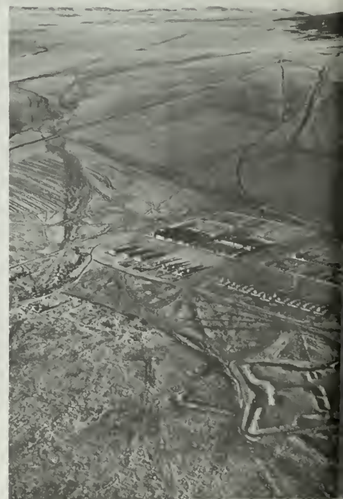
(Above) FORT UNION NATIONAL MONUMENT, NEW MEXICO. This fort, dating from the mid-19 century, offers a good example of a cultural and historic landscape. The historical significance of the fort is tied to its remoteness and use in the landscape, while settlement and land use patterns are seen in the surrounding cultural landscape.