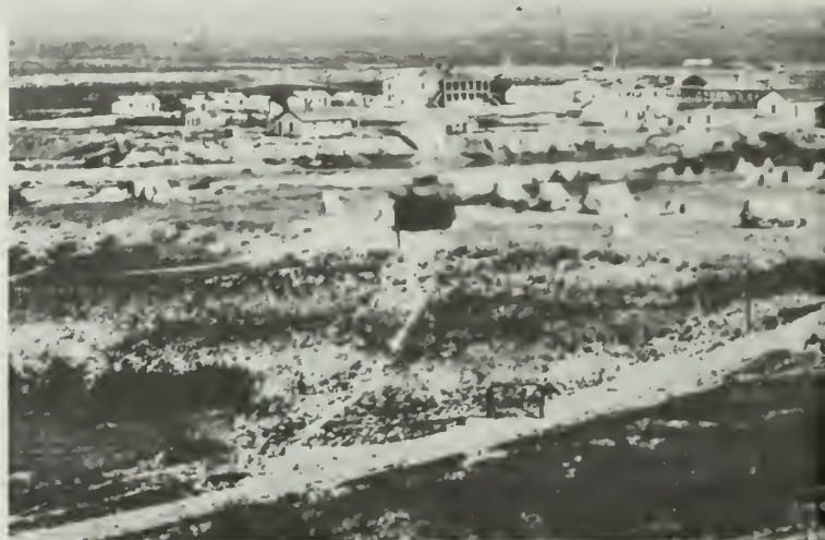
(Right) FORT LARAMIE NATIONAL HISTORIC SITE, WYOMING. These two photographs show Fort Laramie at different periods of its existence: 1868 and 1959. First as a fur-trading post and then as a military post, Fort Laramie played an important role in the settlement of the Wyoming frontier. Its stature as an important historic site is increased by its setting in the open prairie of the region. The layout of the fort and all of its related buildings and other land uses represents a significant stage of control of the western reaches of the country.