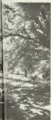
(Left) CEMETERY, VICKSBURG NATIONAL MILITARY PARK, MISSISSIPPI. This cemetery, on the site of the Civil War battle at Vicksburg, commemorates the fallen dead. It is a vernacular designed landscape of historical significance.