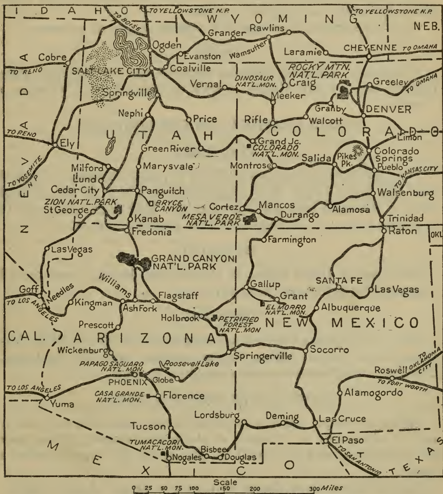
MAP SHOWING PRINCIPAL AUTOMOBILE ROUTES IN COLORADO, UTAH, ARIZONA, AND NEW MEXICO.

Williams. —Williams is 34 miles west of Flagstaff, on the main east and west highway through Arizona. It is the nearest shopping