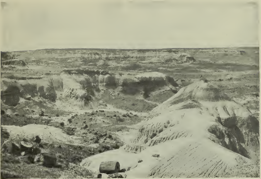
A PORTION OF THE FIRST FOREST.

The profusion of petrified wood is clearly shown.