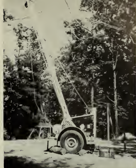
The miniyarder, while small, produced fast turn cycles.