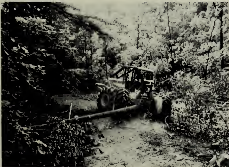
The skidder performed well on slopes up to 20 percent.

or firewood size. The yarder is very portable, and may be mounted on a trailer or a \frac{3}{4} -ton pickup truck (Domenech 1983).