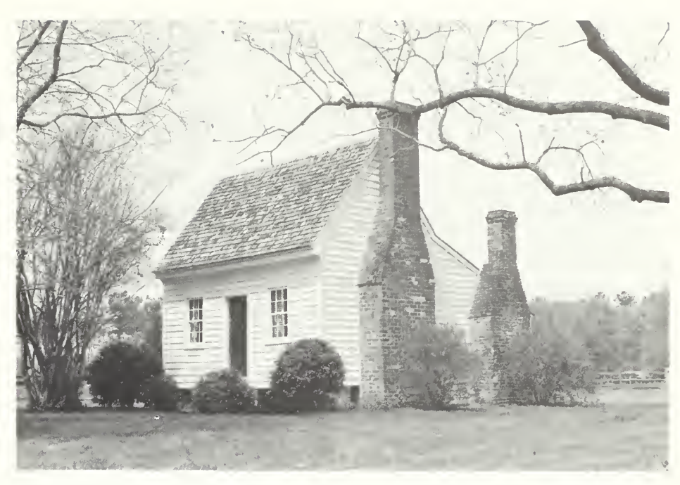
Criteria Consideration C - Birthplaces. A birthplace of a historical figure is eligible if the person is of outstanding importance and there is no other appropriate site or building associated with his or her productive life. The Walter Reed Birthplace, Gloucester vicinity, Gloucester County, Virginia is the most appropriate remaining building associated with the life of the man who, in 1900, discovered the cause and mode of transmission of the great scourge of the tropics, yellow fever.

A birthplace or grave can also be eligible if it is significant for reasons other than association with the productive life of the person in question. It can be eligible for significance under Criterion A for association with important events, under Criterion B for association with the productive lives of other important persons, or under Criterion C for architectural significance. A birthplace or grave can also be eligible in rare cases if, after the passage of time, it is significant for its commemorative value. (See Criteria Consideration F for a discussion of commemorative properties.) A birthplace or grave can also be eligible under Criterion D if it contains important information on research, e.g., demography, pathology, mortuary practices, socioeconomic status differentiation.