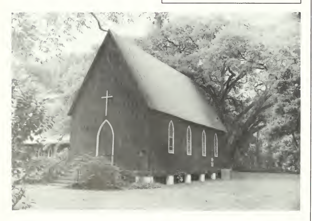
Criteria Consideration A - Religious Properties. A religious property can qualify as an exception to the Criteria if it is architecturally significant. The Church of the Nativity in Rosedale, Iberville Parish, Louisiana, qualified as a rare example in the State of a 19th century small frame Gothic Revival style chapel. (Photo by Robert Obier).