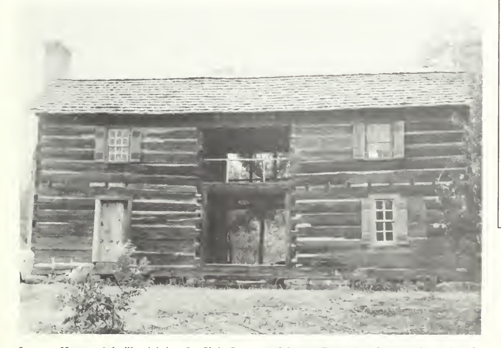
Looney House, Ashville vicinity, St. Clair County, Alabama. Examples of vernacular styles of architecture can qualify under Criterion C. Built ca. 1818, the Looney House is significant as possibly the State's oldest extant two-story dogtrot type of dwelling. The defining open center passage of the dogtrot was a regional building response to the southern climate.