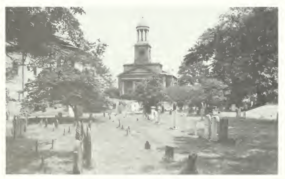
Criteria Consideration D - Cemeteries. The Hancock Cemetery, Quincy, Norfolk County, Massachusetts meets the exception to the Criteria because it derives its primary significance from its great age (the earliest burials date from 1640) and from the distinctive design features found in its rich collection of late 17th century and early 18th century funerary art.

• A cemetery containing graves of State legislators is not eligible if they simply performed the daily business of State government and did not have an outstanding impact upon the nature and direction of the State's history.