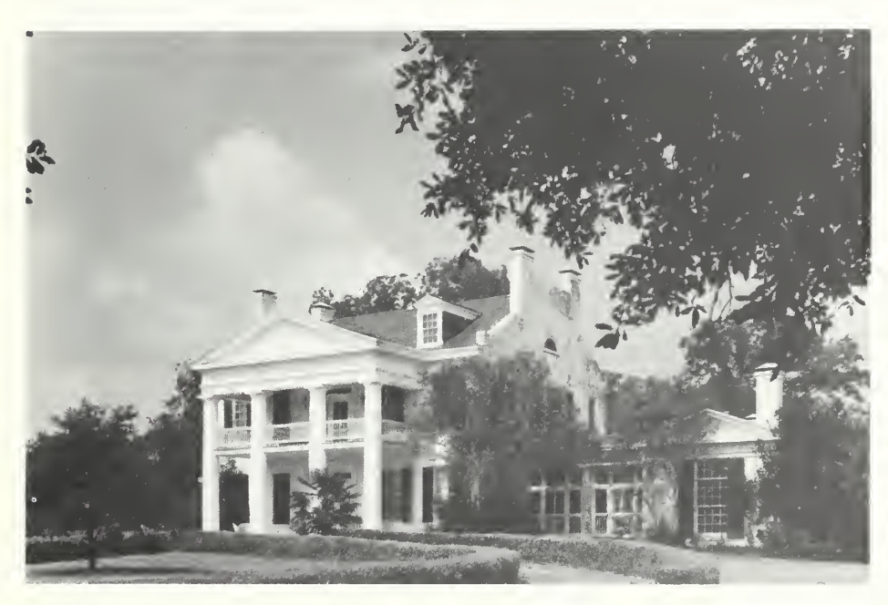
Richland Plantation, East Feliciana Parish, Louisiana. Properties can qualify under Criterion C as examples of high style architecture. Built in the 1830s, Richland is a fine example of a Federal style residence with a Greek Revival style portico.

Properties may be eligible for the National Register if they embody the distinctive characteristics of a type, period, or method of construction, or that represent the work of a master, or that possess high artistic values, or that represent a significant and distinguishable entity whose components may lack individual distinction.