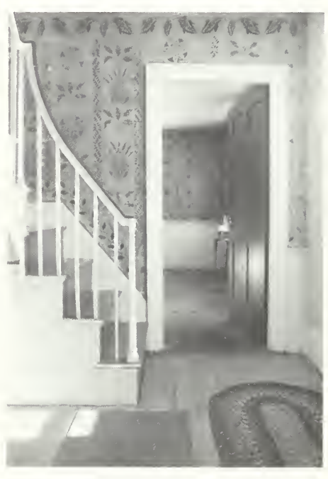
Grant Family House, Saco vicinity, York County, Maine. Properties possessing high artistic value meet Critrion C through the expression of aesthetic ideals or preferences. The Grant Family House, a modest Federal sytle residence, is significant for its remarkably well-preserved stenciled wall decorative treatment in the entry hall and parlor. Painted by an unknown artist ca. 1825, this is a fine example of 19th century New England regional artistic expression. (Photo by Kirk F. Mohney).

Part IV: How to Define Categories of Historic Properties. Throughout the bulletin, however, districts are mentioned within the context of a specific subject, such as an individual Criterion.