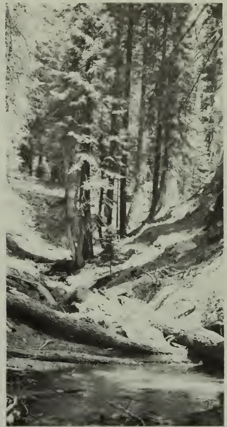
New woody debris in Suwane Creek is typical of the interaction taking place at Sequoia/Kings Canyon NP.

Focus of the first pulse was largely on collections of basic descriptive data on the stream, riparian, and forest systems at the selected study sites. These included four stream segments associated with mixed-conifer forest (Suwane and Dorst Creeks), giant Sequoia forest, and a meadow. Over 400 m of stream reaches were analyzed and mapped. Characteristics studied included channel morphology (including cross-sections), woody debris, retention features other than woody debris, flow patterns, retention characteristics (based on leaf release study), and biomass and composition of the riparian vegetation. Four hectares of adjacent forest were analyzed with