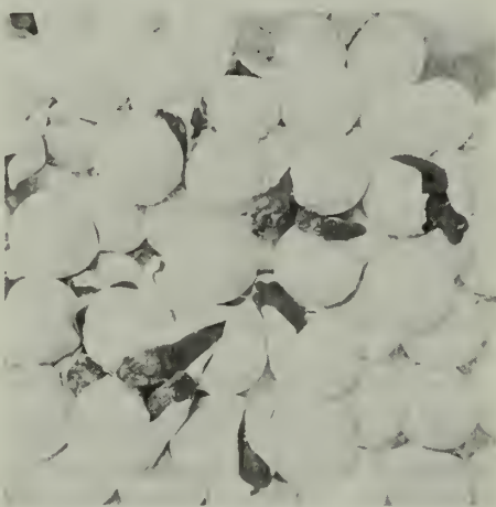
Atlantic Ridley Turtles fight their way out of their shells.

A number of possibilities may have caused this catastrophe. We are looking for the presence of pesticides heavy metals, or other environmental contaminants in the eggs and sand. We also are having the National Marine Fisheries culture and identify two