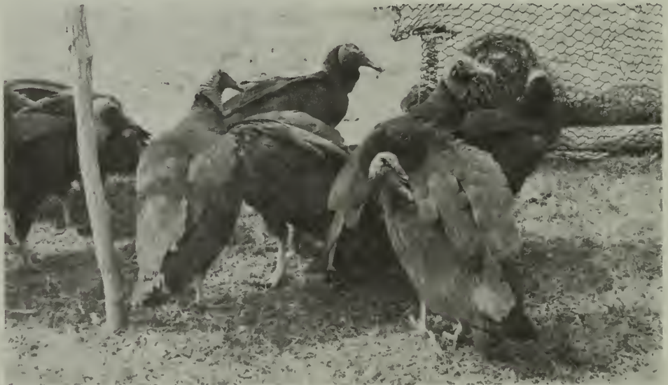
Awaiting processing, these trapped vultures stand in a holding pen. They will be weighed, tagged, and their blood sampled.