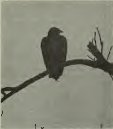
Like some Halloween apparition, this lone Gettysburg vulture surveys the scene.