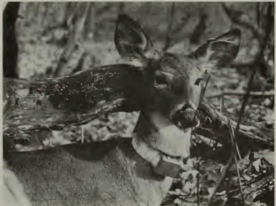
Visitor pleasers are these perky white-tailed deer, highly visible along the Skyline Drive. Radio collars help park management keep track of their movements.

Deer have a great impact on their habitat throughout the Park, and this impact is especially noticeable near the Skyline Drive where abundant grass supports artificially high deer populations year-round. Woody browse is used extensively by deer in the backcountry and especially in wooded areas along the Skyline Drive. Enough deer are likely removed from the Park's population each year through predation, road kills and hunting of animals that move outside the Park boundary to prevent gross over-use of the habitat, but the impact of deer on native vegetation still is greater than it would be without man's influence on the animal's habitat. (While the Park contains