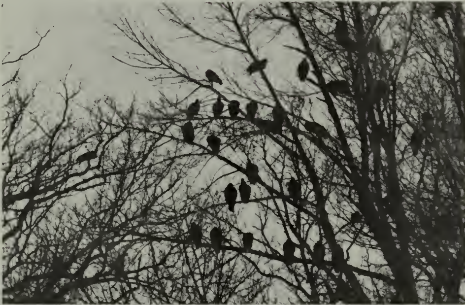
A collegial group of vultures roost together in the Gettysburg oaks.

will have explicit data and expertise available to counter any unfounded criticisms of Park management policies. Results also will contribute to development of urban forestry practices by identifying important wooded tracts used as roost sites. Features characterizing these sites can be delineated and incorporated into management recommendations of wooded habitats for vulture roost sites at other eastern Parks.