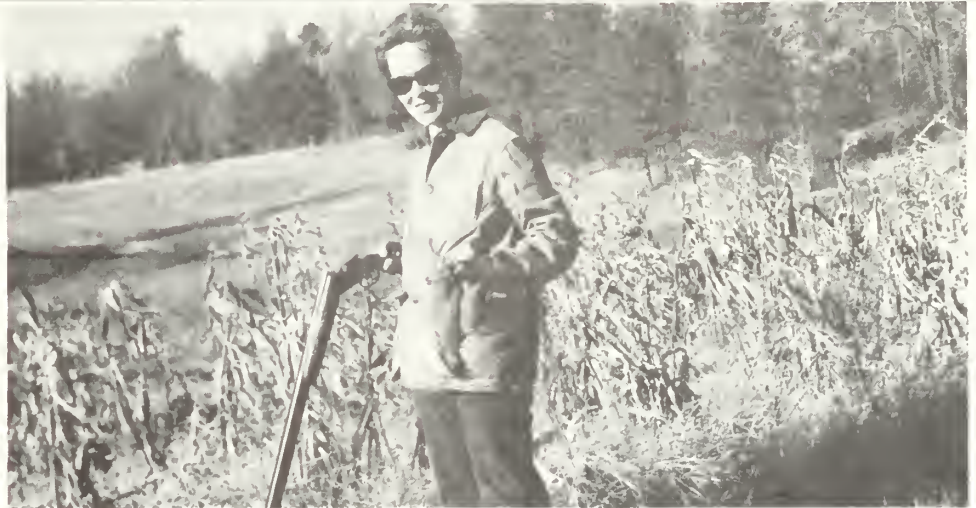
DOVE HUNTING DOESN'T BELONG ONLY TO MEN This Lass Gets Her Share of Action on Opening Day