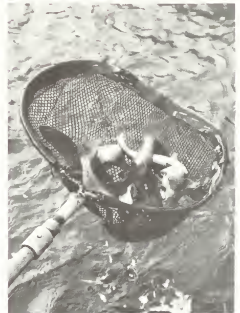
THESE FISH SOON TO BE RELEASED In Streams of north Georgia Mountains