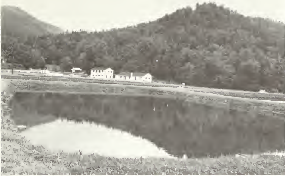
BURTON HATCHERY TURNS OUT TROUT FOR ANGLERS North Georgia Facility Handles Almost 500,000 Annually