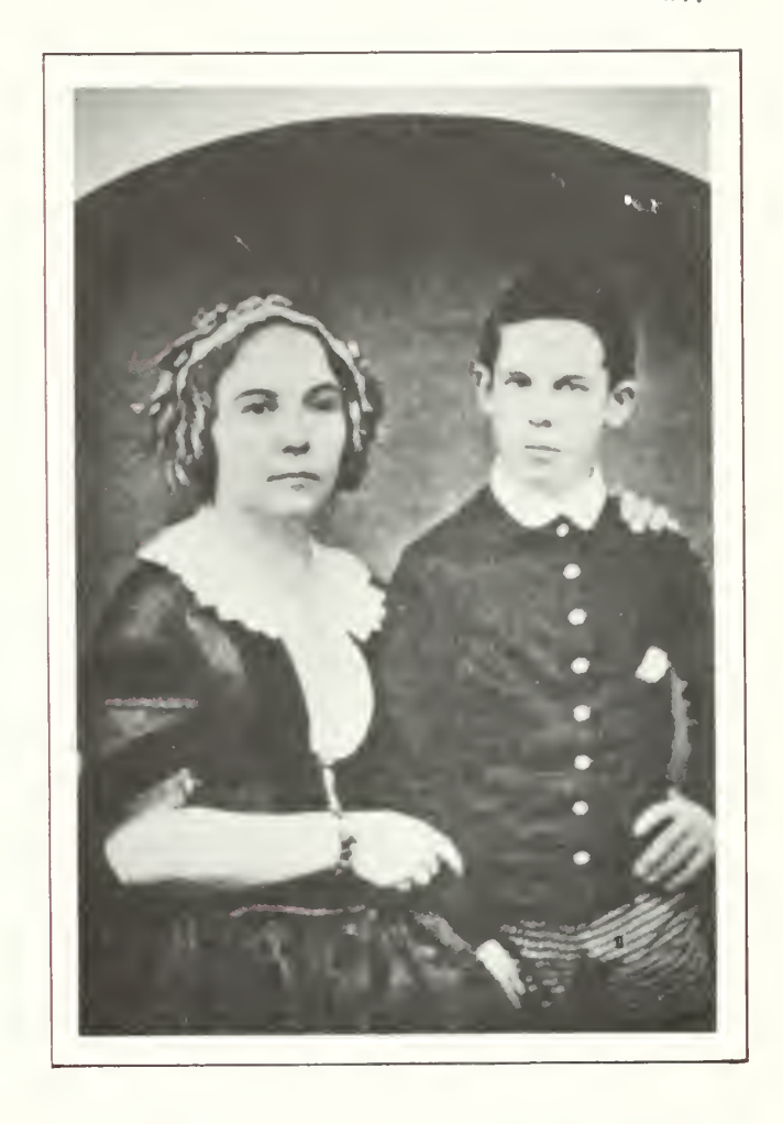
Historic Furnishings Report