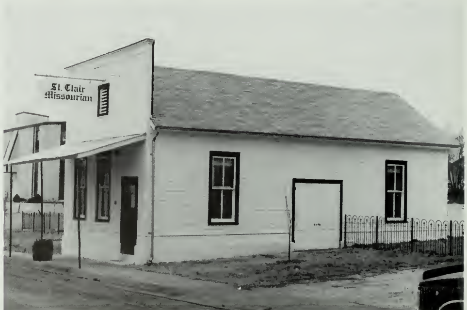
Panhorst Feed Store

The National Register nomination form records the property at the time