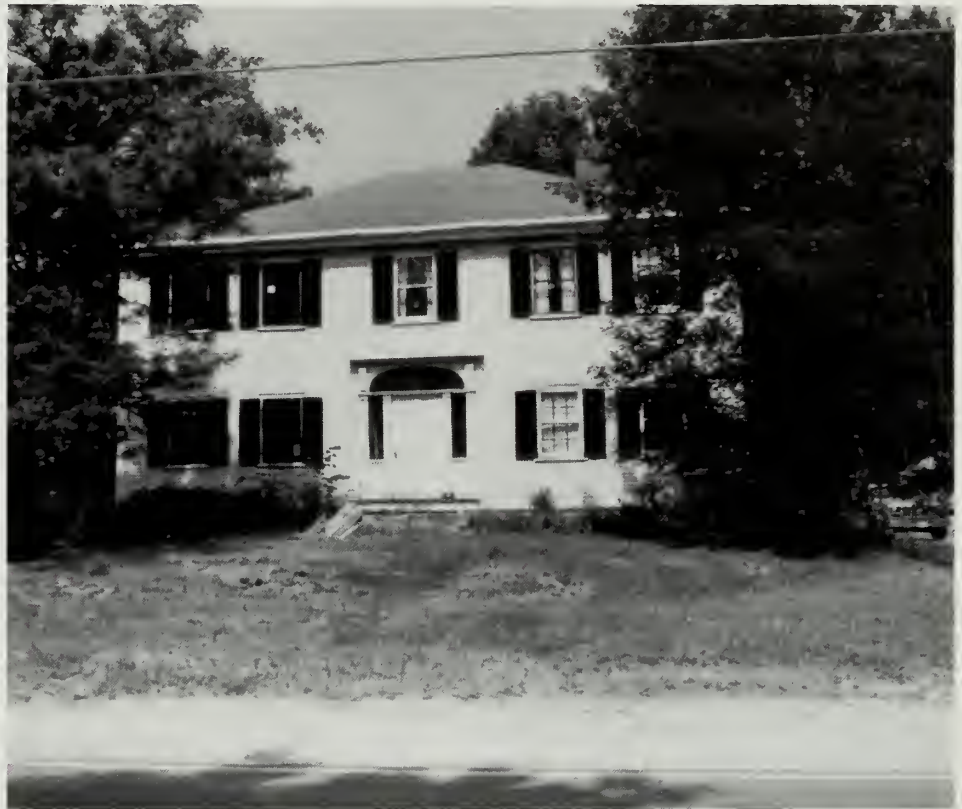
Osgood Family House

Universities and colleges: photograph collections, architectural history collections, map and periodical collections, and manuscripts and archives collections. Some universities and colleges have preservation or architecture programs. Frequently, their students will have done surveys of local resources and local history as class projects. They may also be a good source of suggestions about further research possibilities for your specific property.