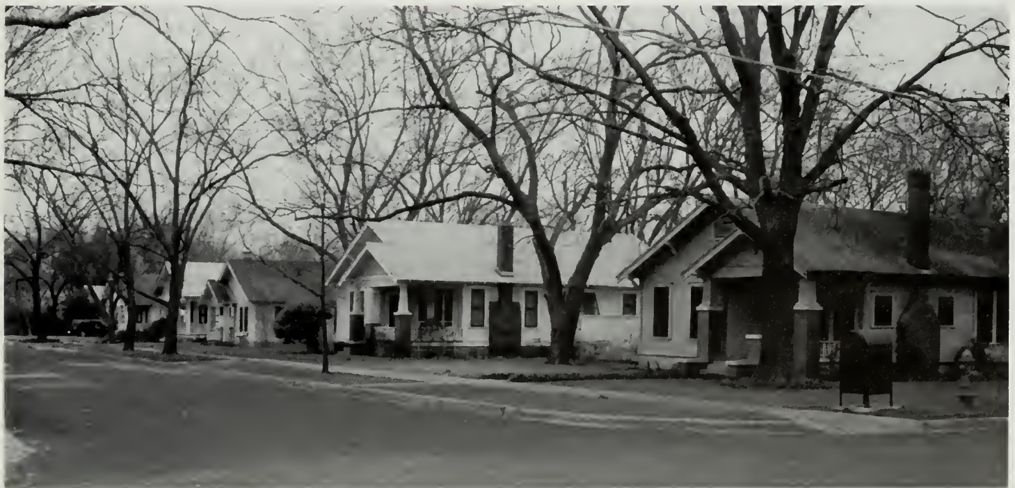
Hyde Park Historic District

Additional information may be available from local landmarks and historic district commissions, particularly if the community in which your property is located is a Certified Local Government (CLG). Local governments frequently collect information about landmark properties, historic districts, and archeological sites. If the property being researched is owned by the U.S. Government, the Federal Preservation Officer (FPO) should be contacted for information as well. The SHPO can refer you to the relevant FPO for the agency involved.