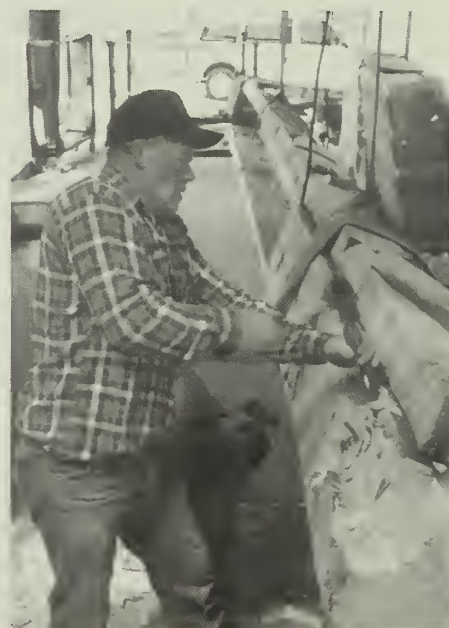
Figure 6. Three of the 7 totems had support posts. The steel bolts connecting the support posts to the totem had rusted and often needed to be chiseled out of the support post. Note the hollowed back of the totem which extended nearly the entire length while the support post extended only about half way.

base. Support posts were detached by removing the 1/2" all-thread steel rods that had connected the posts to the carved poles (see figure 6). The totem poles then were cleaned with water using natural bristle brushes and a garden hose with a spray attachment. Since the red cedar poles had