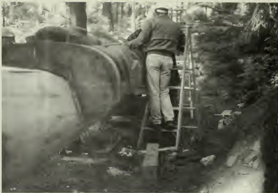
Figure 8. Due to the heavy weight of the totems, they were usually attached to their fitted support post and re-erected at the site.

mold and mildew. The utilization of a wrap or bandage was considered the most effective application method and, in addition, it would retard the borate from leaching out of the wood. It is anticipated that the wraps will be inspected in 10 years to assess their condition and possible replacement. (This would only require removal of the dirt around the bases to a depth of approximately 20" so that a new wrap could be applied, if needed.)