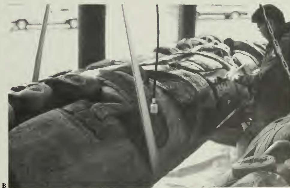
Figure 7. Borates were applied to the totem using a garden sprayer and brushes. This was followed by an application of a water repellent with mildewcide. Photo A is during application and photo B shows totems while drying.