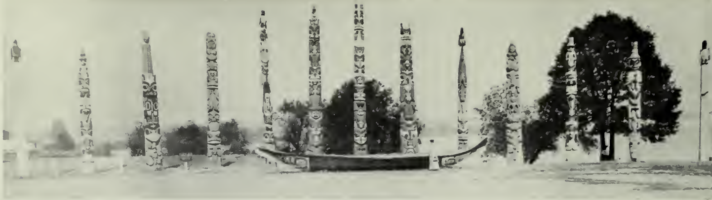
Figure 1. Some of the Sitka totem collection shown on display at the 1904 Louisiana Purchase Exposition. Totem poles (totems) generally serve one of four purposes: crest poles give the ancestry of a particular family; history poles record the history of a clan; legend poles illustrate folklore or real life experiences; and memorial poles commemorate a particular individual. The first recorded sightings were by European explorers and traders in the late 18th century. Detached exterior poles reached their zenith in the late 19th century, standing along the village fronts of the Haida and Tlingit Indians of northern British Columbia and extreme southeast Alaska.

park has suffered from the effects of moisture throughout much of the twentieth century. The most serious fungal decay recently encountered occurred at the base of the poles, although fungal growth and structural problems, including splits and cracks, were prevalent on the above-ground carvings as well.