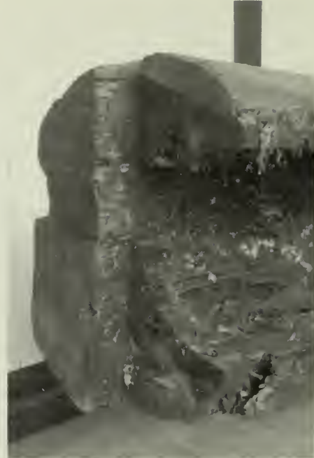
Figure 5. Deterioration occurred between the support post and the hollowed back of the totem. Coal tar had been applied in the past to the hollowed back of this totem to deter fungal decay.

readily detected by use of an applied color test for boron, but it does require slicing off a section of the wood. The work with the totem poles involved removing an underground butt section, treating it with borate and water repellent, and placing it outdoors to serve as a test.