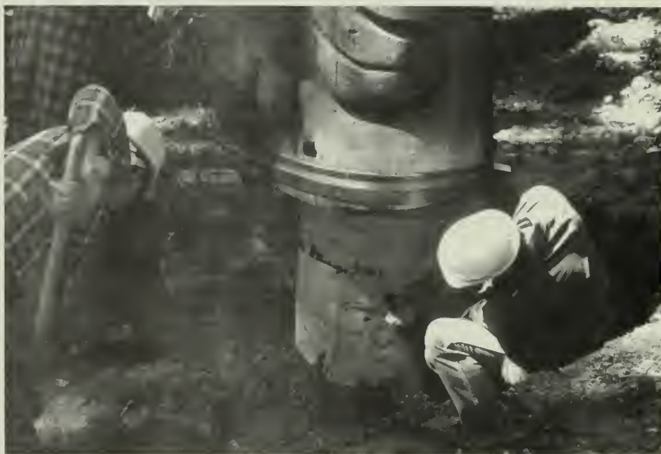
Figure 9. After securing the support post in the ground, a wood preservative in a "bandage" form was attached to the support post before dirt was filled to grade level.

With the decision to keep the poles uncovered and displayed outdoors, experience had shown that effective chemical preservatives were needed in order to provide more long-term protection of the carvings.