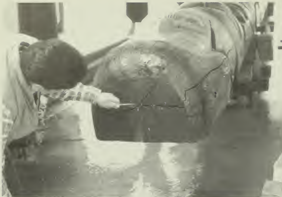
Figure 4. Organic debris had collected in the splits and cracks, contributing to moisture retention and fungal growth.