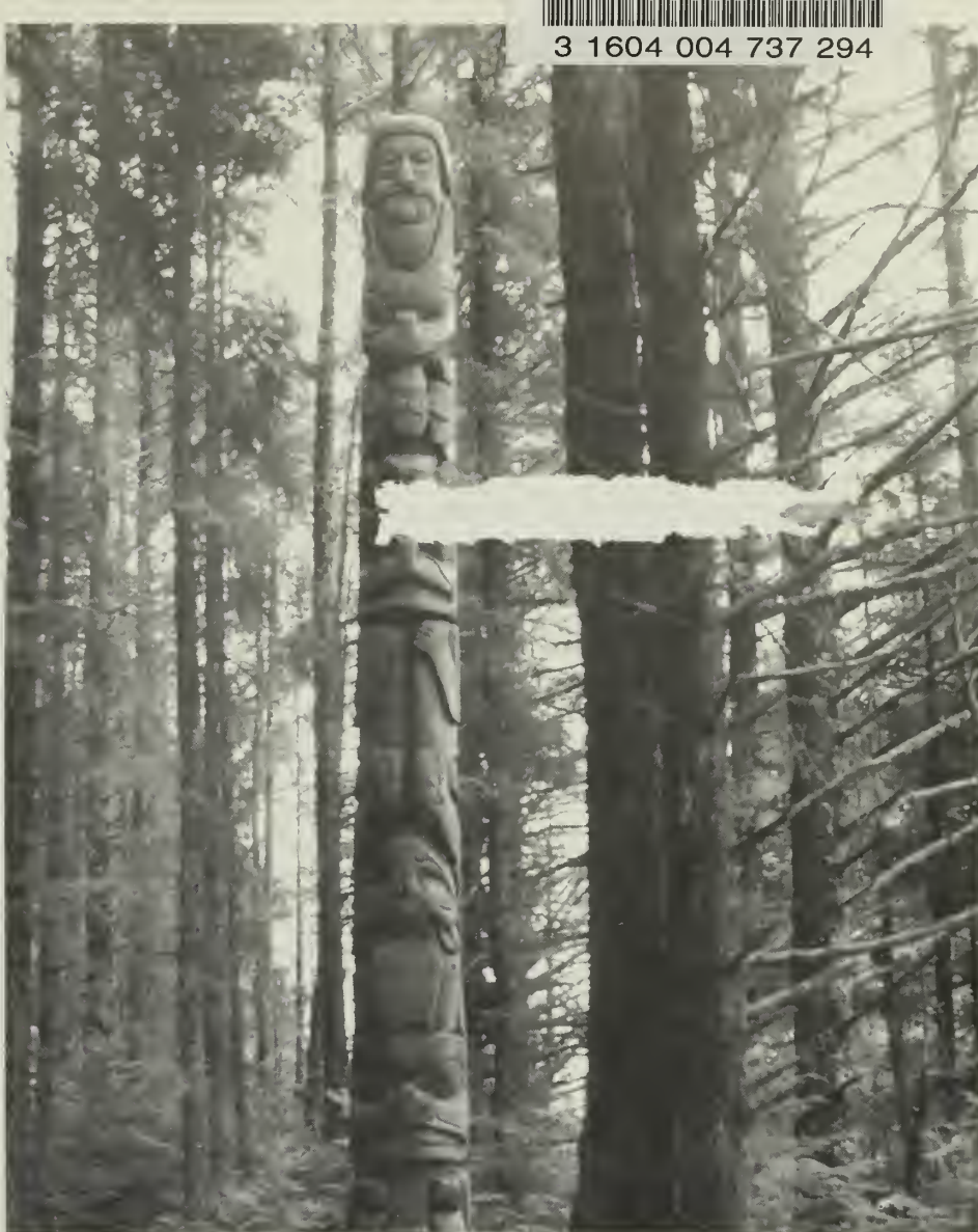
Figure 10. Application of a water repellent to the totems will probably be needed approximately every 3 years. This can easily be done in place. The support post's "bandage" wrap located just below grade, will need to be inspected in about 10 years.

Selected for use on various totem poles at Sitka because of its purported effectiveness and relative safety, borate treatment has potentially broad applications to wooden structures and outdoor artifacts. Log buildings, window sills, and above-ground outdoor wooden objects subject to decay or insect damage are just some of the potential applications. There are commercially available borate preservatives designed for topical applications to seasoned or partially seasoned wood such as that which was applied to the poles at Sitka. Careful monitoring of the carvings on the poles along with the test log will help document the long-term value of borate preservatives when applied to unpainted wood in this moist environment. Successful results will depend in part on regular maintenance of the poles, particularly in removing collected organic debris and in periodically reapplying a water repellent coating (see figure 10).