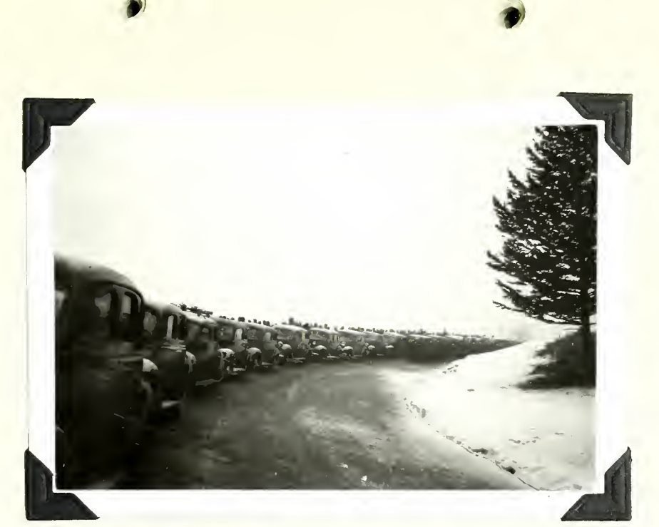
Easter Sunrise Song Services held at Mammoth Hot Springs, Yellowstone National Park. Visitors in cars.