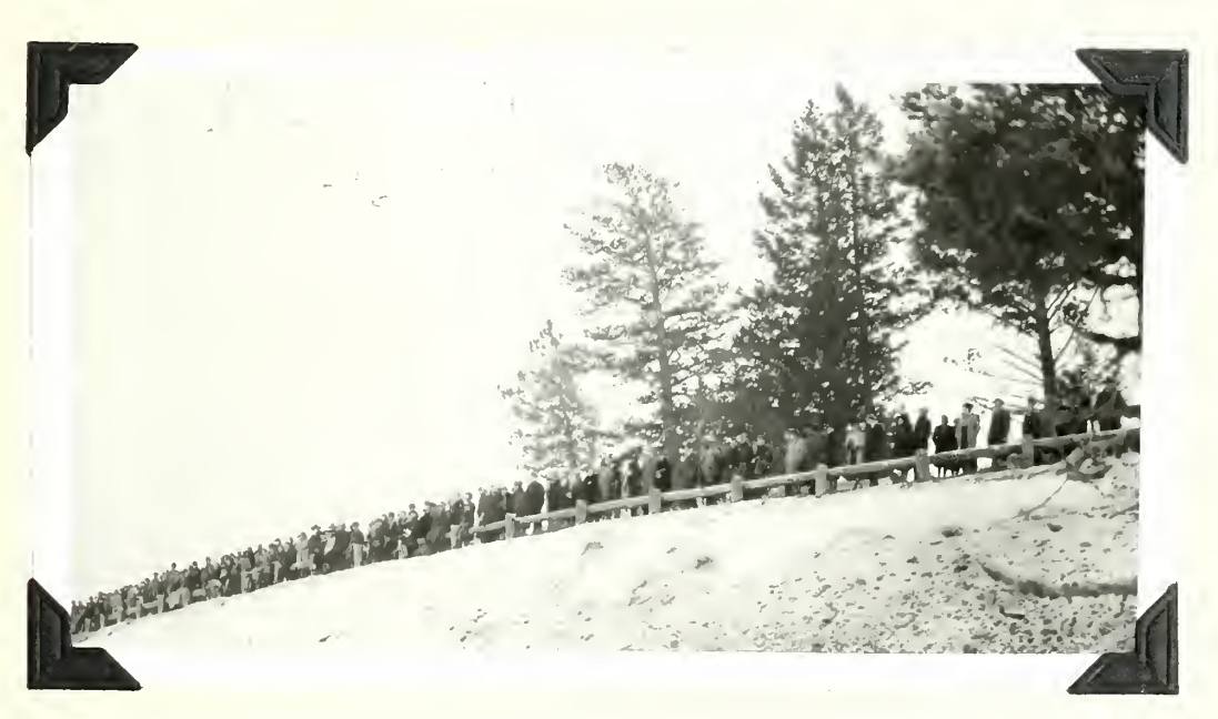
Easter Sunrise Song Services held at Mammoth Hot Springs. Showing part of the group of visitors present.