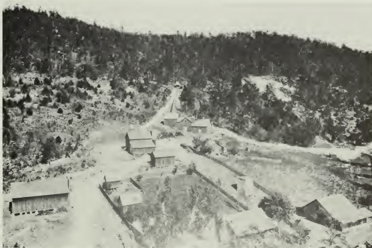
Morning Star Mine and Mill, Rush, 1904