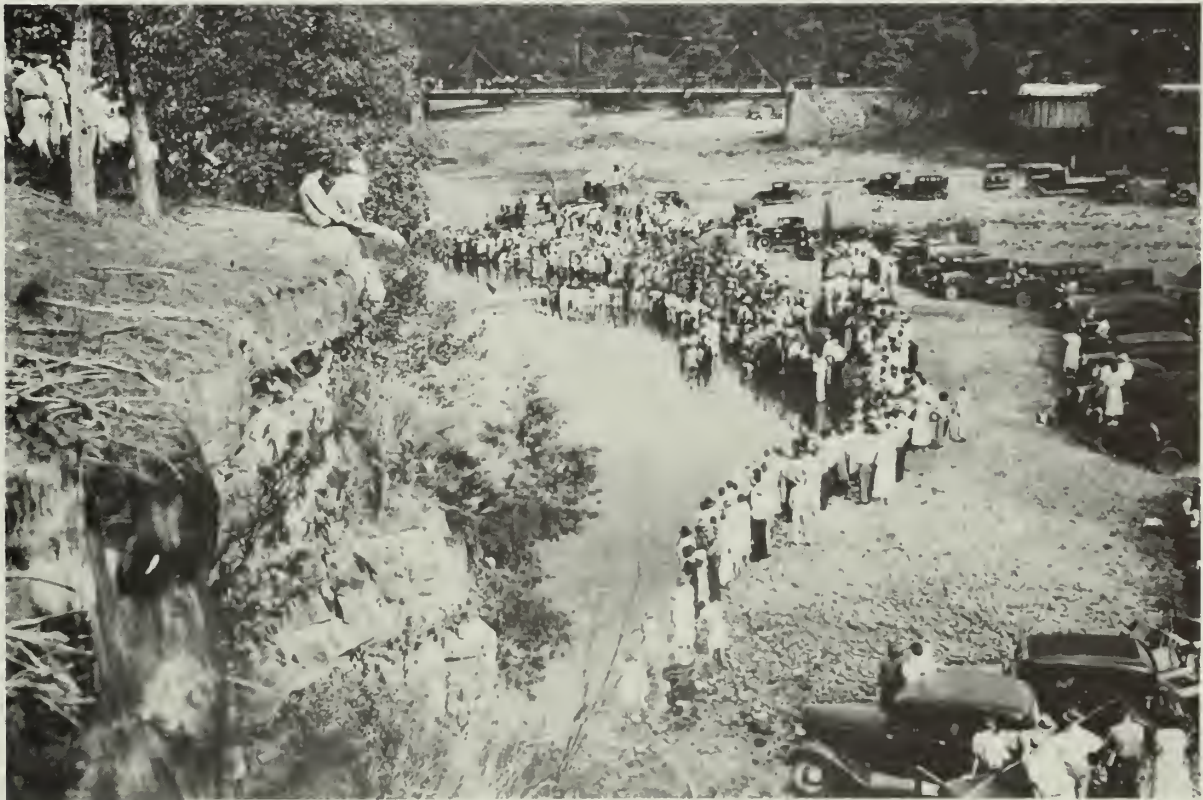
River baptizing near Jasper, 1934

Interestingly enough, the domination of religious life by the Methodist Church which was evident around 1860 had been replaced by the prevalence of no particular sect by the turn of the century. The Methodist Church retained its former influence only in Marion County where 44 percent of the inhabitants who declared any affiliation were Methodist; but the Baptists constituted a close second by registering almost 40 percent of the declared population. In Searcy County the role of the two religions was reversed: the Baptists claimed 46.8 percent of the church-going populace while the Methodists reported a total of 35 percent. The settlers in Newton County shunned both of those organized religions as 43 percent announced membership in the Disciples of Christ, with the Baptists constituting a distant second with 16 percent. 48 The total dominance of Protestantism was disrupted only in Searcy County where in 1906 there were eighty Roman Catholics who formed 3 percent of the county's church attending populace. 49