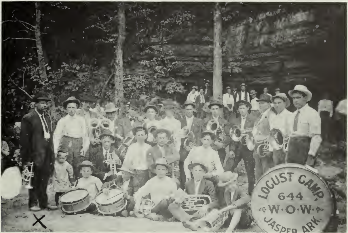
Picnic, Diamond Cave Spring, ca. 1910