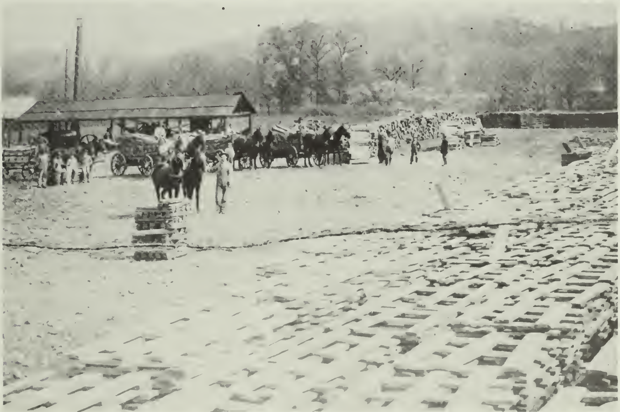
Saw Mill, Searcy County, ca. 1890s

decline of the lumber industry along the river can be attributed to two essential factors: transportation and the lack of a foresighted timber management policy. A constant problem was the difficulty of transporting the logs to market. Because the river could be used only during periods of high water, timber shipment was at best intermittent. Although the establishment of the railroad in 1902 allowed logs to be shipped from the more convenient location at Gilbert, it remained a cumbersome procedure. More important was the fact that the early logging companies cut where it was most profitable -- among the large concentrated stands of cedar and walnut. Such indiscriminate practices of harvesting timber, while eminently practical at the time, deprived the lumber interests of a dependable source of selected mature trees in succeeding years. The short-lived lumber boom became a victim in part of its own shortsighted policy. Thus while scattered independent lumber operations continued, their contribution to the valley's economy remained negligible.