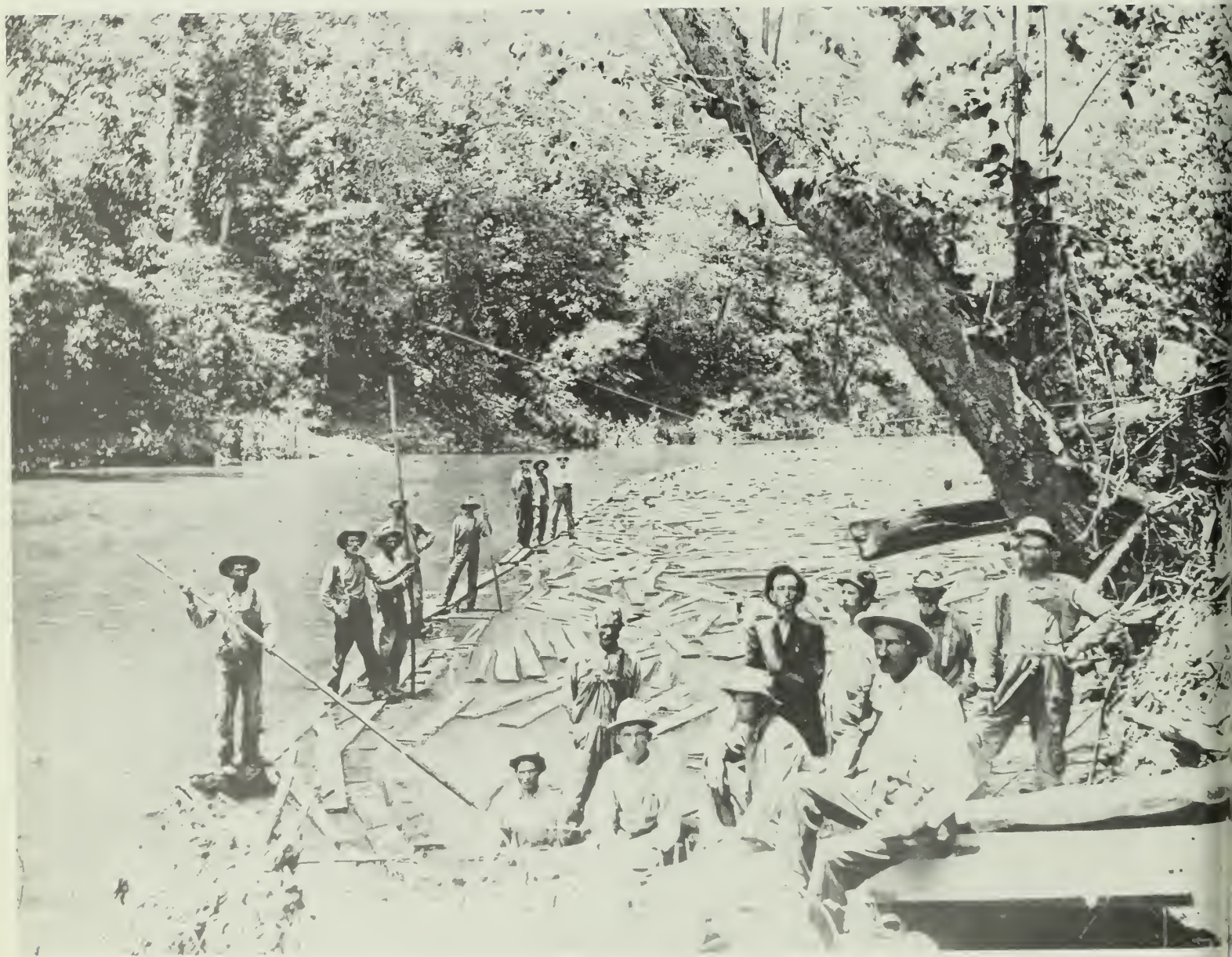
Rafting logs on the Buffalo, 1890s