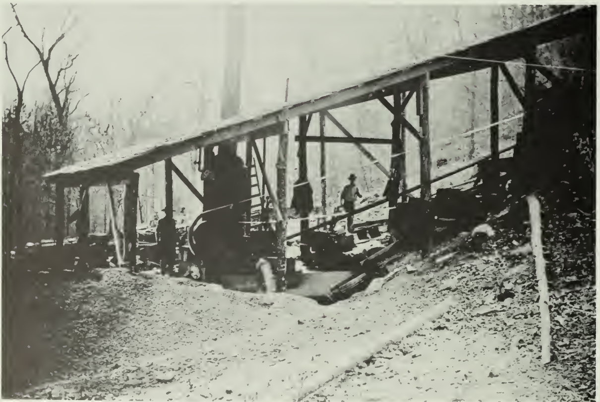
Panther Creek Mine, Mill Shed, 1916