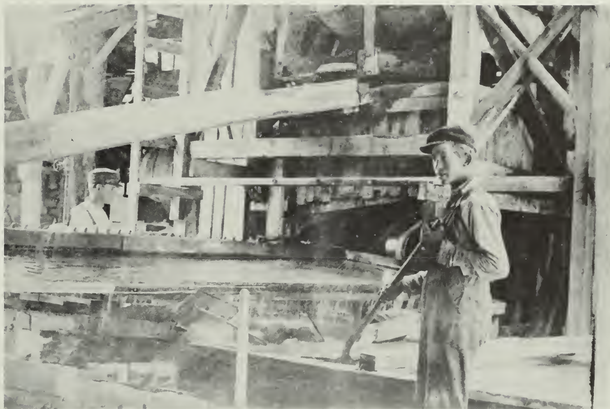
Panther Creek Mine, Newton County, 1916

The decade of the 1890s served to establish the foundation for the later "boom" during World War I and to advertise the zinc field to the nation's mining community. While interest vacillated, it was reported in 1899 that the influx of prospectors was so great that the surrounding agricultural region was having difficulties in providing enough sustenance.