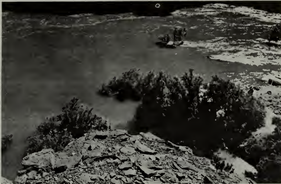
19.3 Mile Camping Beach is shown in the top photo as it appeared in June 1983, when the river flow was 60,300 cfs, and in the bottom photo as it looked in October 1983, when the water flow was down to 25,000 cfs. The high June runoff has scoured most of the tamarisk except for a few bedraggled plants and left the beach essentially barren.