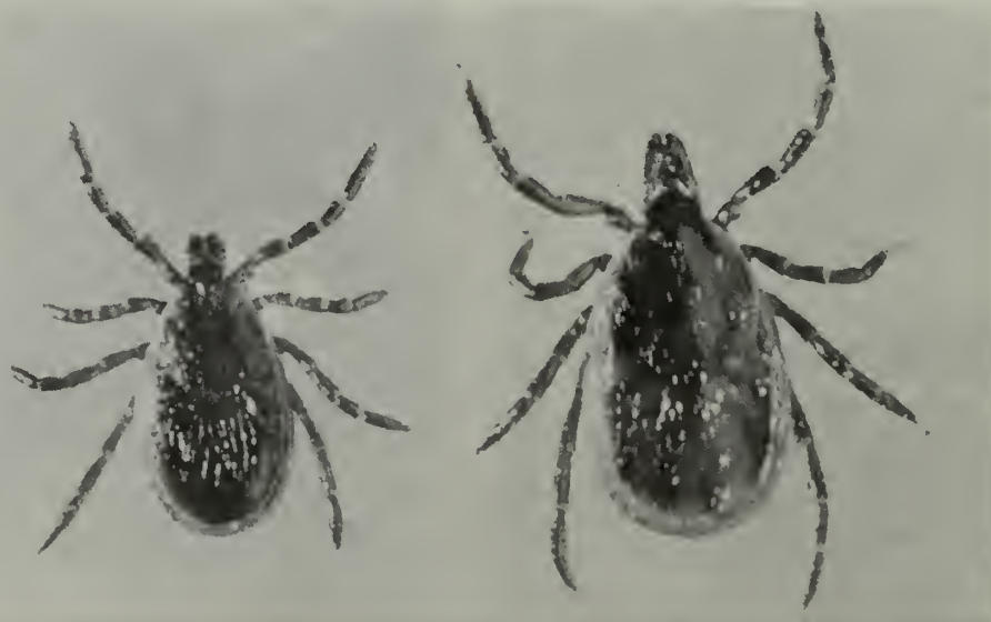
The vector for Lyme Disease in the east and midwest is the Northern Deer Tick, here shown with the female on the right, the smaller male on the left.

The public policy questions are complex and involve divergent public interests. NPS management policies concerning health and safety, natural re-