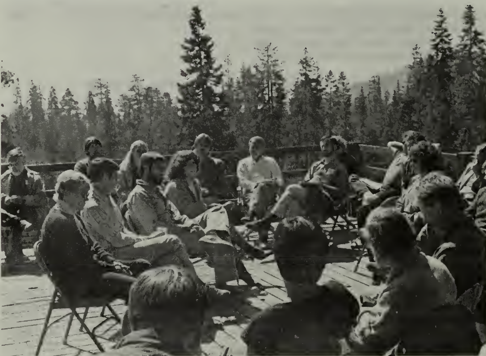
Touching the resource while they explore ways of coordinating science, resource management, and interpretation, these workshop participants enjoy the sunshine and balmy September temperature on the deck of Montecito-Sequoia Lodge just outside Sequoia-Kings Canyon National Parks.