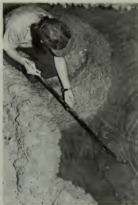
Park Ranger Donna Giannantonio uses dipstick to fish coins out of a Carlsbad Cavern pool, prior to mechanical mixing of the water.

Coins, plastic gunk, bread wrapper, all contribute to the debris that must be fished out of Carlsbad Cavern pools before they can be restored by mixing procedures. The screen covers, one of which is shown at left, have been tried in pools far off the trail that appear as pits and are targets for thrown items, but eventually they tear and drop their loads into the pools.