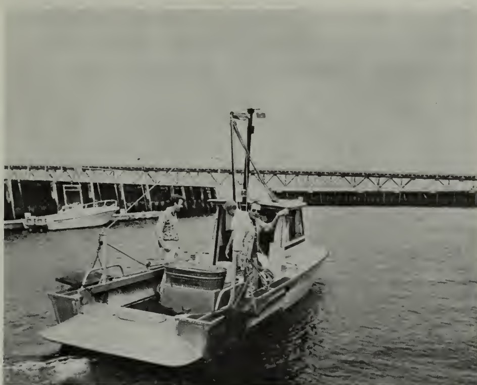
The research vessel, Herbert Johnson, leaving port for data collection on Jamaica Bay, part of Gateway National Recreation Area in New York City.

anchors, marked with floats, and set perpendicular to the shoreline or shoal bank. They were retrieved after 24 hours, and the data were recorded. A 50-foot, hand-held seine net was used to sample along the shoreline. One sweep was made at each of the six chosen sample stations. Again, water quality parameters and fish data were recorded.