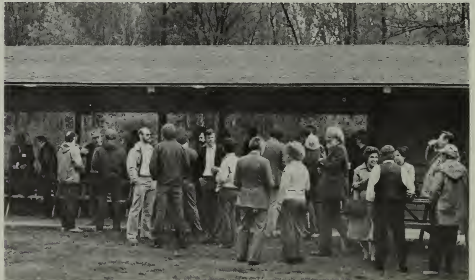
Dunes researchers shared their interests at a barbeque at Indiana Dunes State Park.