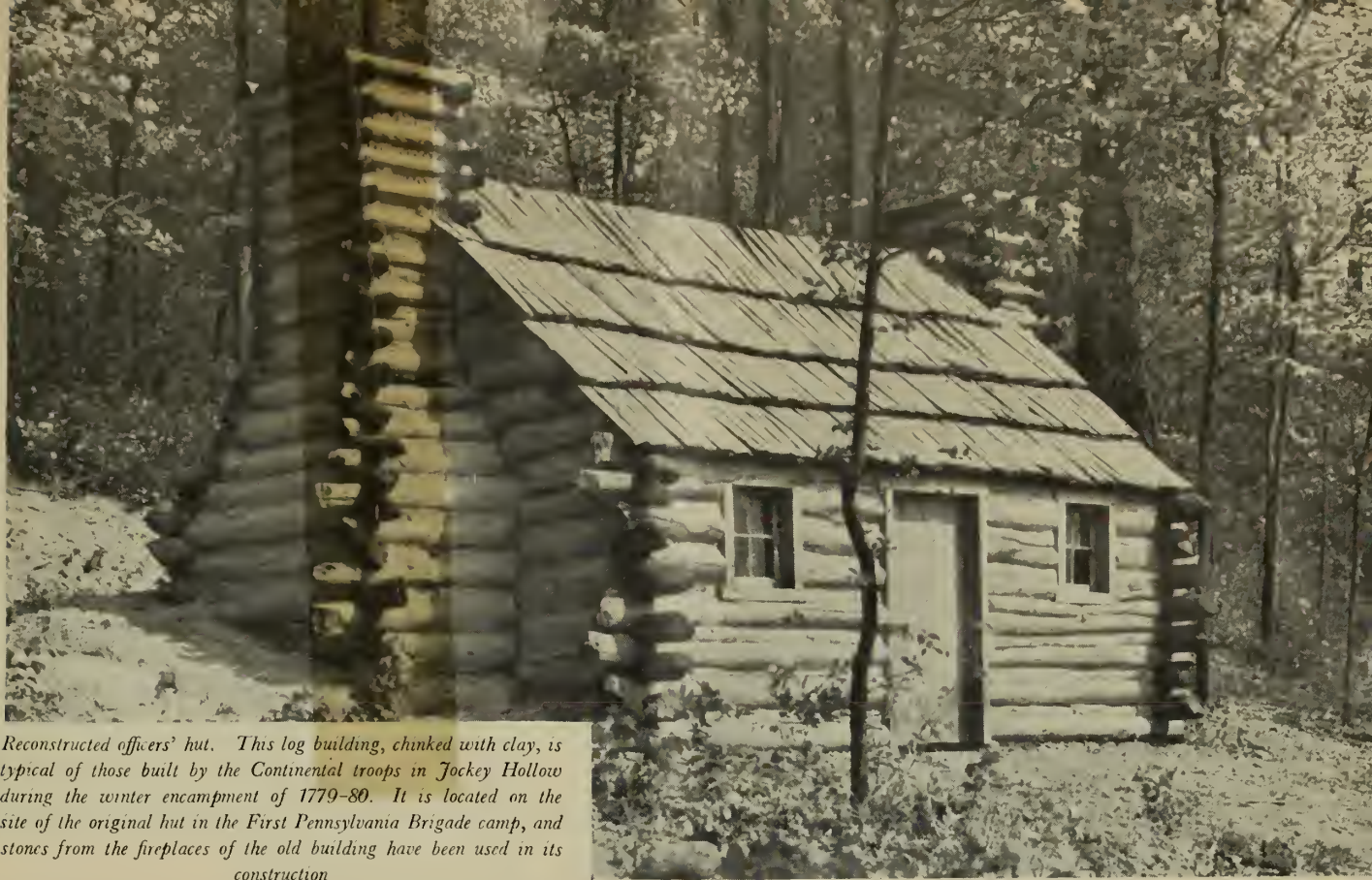
Reconstructed officers' hut. This log building, chinked with clay, is typical of those built by the Continental troops in Jockey Hollow during the winter encampment of 1779-80. It is located on the site of the original hut in the First Pennsylvania Brigade camp, and stones from the fireplaces of the old building have been used in its construction