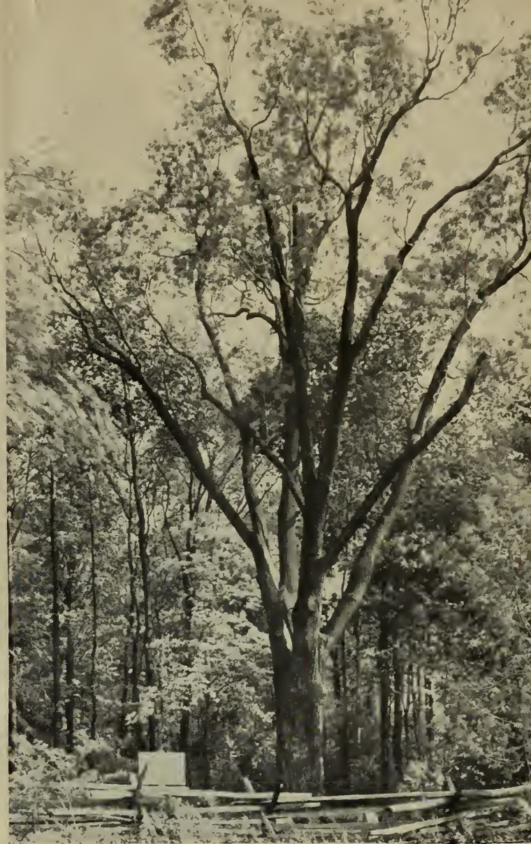
The Bettin Oak. Near the base of this old tree, still standing on the Jockey Hollow Road, is the grave of Capt. Adam Bettin, who was killed while trying to restore order during the mutiny of the Pennsylvania line on January 1, 1781

IN ADDITION to its great historical significance, Jockey Hollow is a wildlife sanctuary, and also offers unusual scenic attractions. Wooded hills, purling brooks, and flower-covered fields combine to form an arresting landscape. Here is a hillside covered with scarlet sumac; there a road leading through rows of white dogwood; there again a valley of purple ash, red maple, and