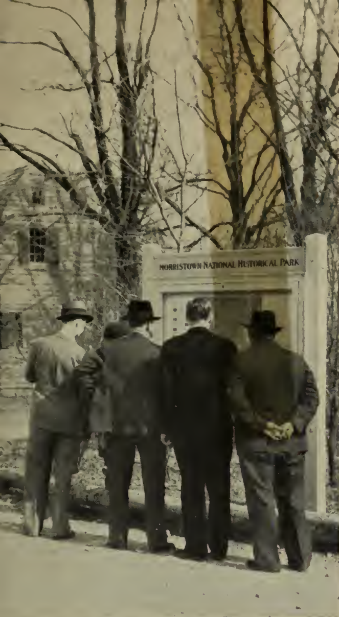
Visitors study the map of the park in order to orient themselves before starting out to view its points of interest. This particular map is located adjacent to the Wick House, but similar maps are found elsewhere in the park