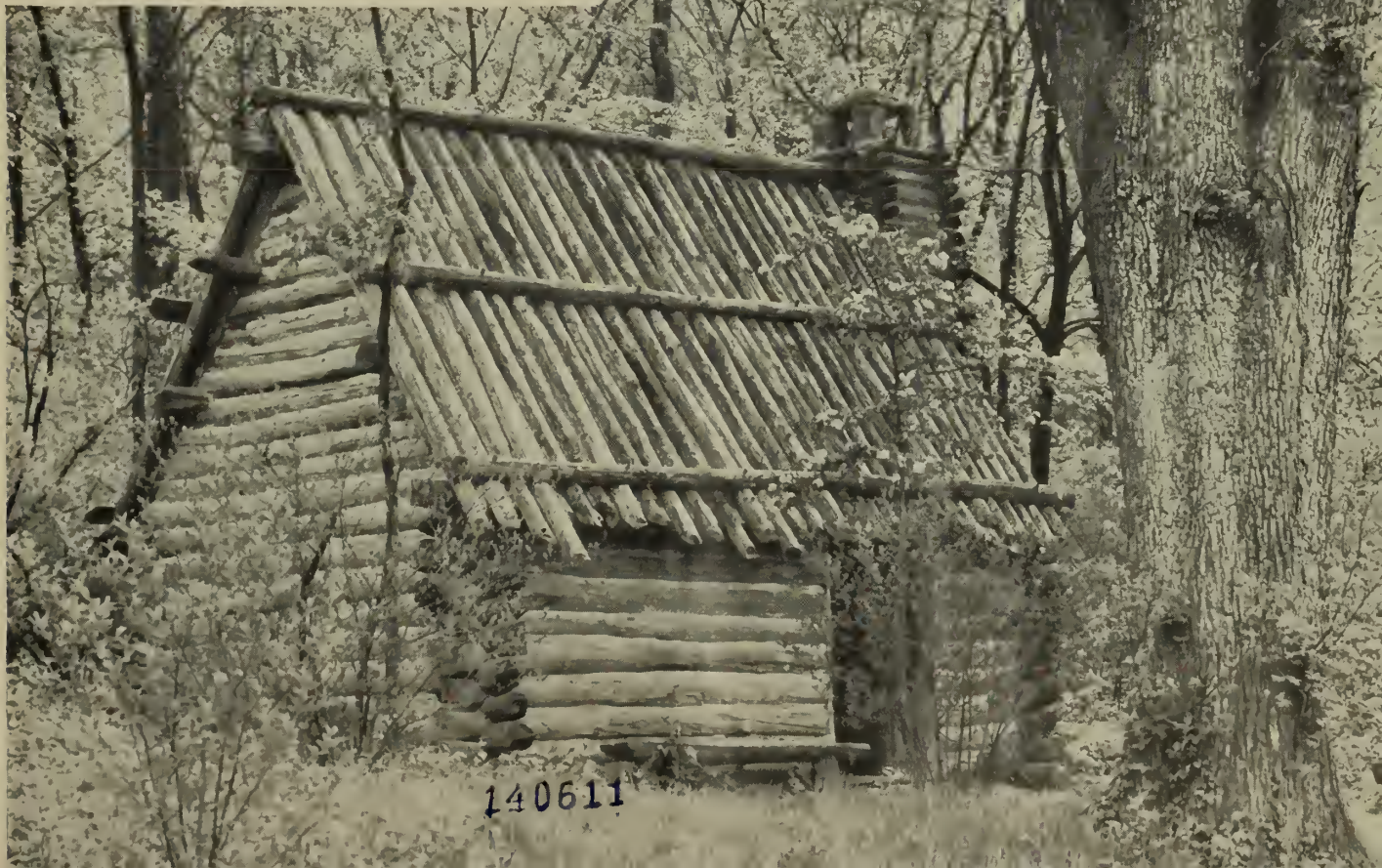
Reconstructed soldiers' hut in Jockey Hollow. About a thousand buildings of this type sheltered the Continental Army encamped near Morristown in 1779-80. The hut shown here is an approximate replica of an original structure which once stood on the same site. It is built of logs, chinked with clay, and fastened together with nails and wooden pegs. From 10 to 12 soldiers were billeted in each hut