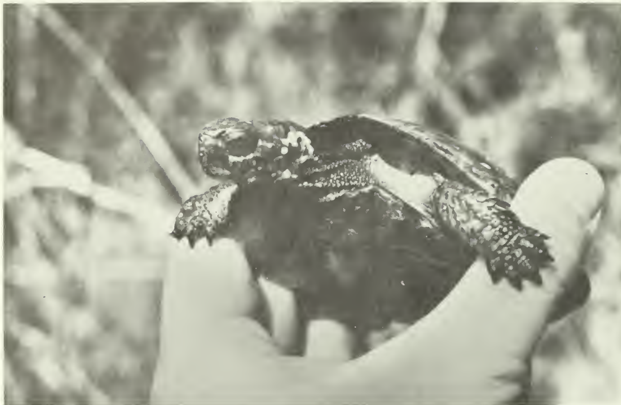
Fig. 1. Adult bog turtle.