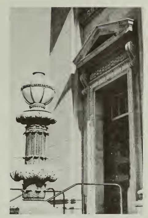
United States Post Office, Des Moines, Iowa, C. 1908-10. The architectural significance of a building is often illustrated through a collection of rich detailing. This doorway and acanthus leaf lantern are part of a post office that represents one of the best examples of classical architecture in central Iowa.

In some cases, a single quality or association under one of the criterion, and the retention of the most important quality of integrity, may be sufficient to demonstrate that the post office is eligible for the National Register. When the quality or qualities of significance, or the significance of the theme, are weaker, however, a combination of characteristics may be necessary to justify eligibility. In marginal cases, it is necessary to compare the post office's qualities of significance and integrity to those of other properties within the same themes to decide which property or properties best represent the significant themes. The post office may or may not surface as the best or one of the best examples of a theme. In some cases, a survey conducted to identify these properties for comparison may reveal a related group of post offices, or post offices and other properties, all of which meet National Register criteria. If the post office is the only identified property in its theme, that will strengthen the case for listing the National Register, but there may be instances where a post office that is the only surviving representative of an important theme fails to possess a strong enough justification of significance or sufficient integrity to