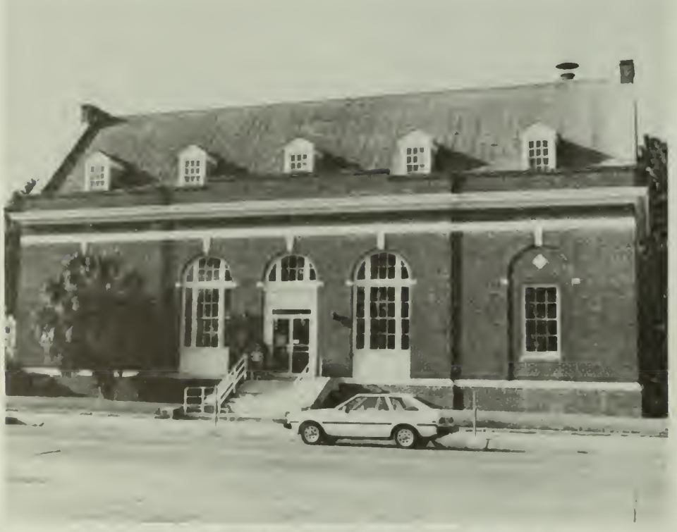
Jennings Post Office, Jennings, Louisiana, 1915. Representing a degree of stylistic sophistication unexpected in a small town in rural Louisiana as early as 1915, the Jennings Post Office is noted for its progressive design in a commercial center otherwise characterized by more modest vernacular buildings.

There are many ways in which a post office may be significant for its role in the historical development or its relationship to the architectural character of a community, the State, or the nation. Theoretically, a post office, in its role as a post office, could represent significant themes in almost all of the areas of significance used by the National Register.<sup>5</sup> Identified themes must be significant in American history on the local, State, or national level, as demonstrated by scholarly research. Listed below are some of the themes that post offices could represent in their role as communications centers. Time frames are not included as they would vary according to the particular post office, locality, and relevant historic factors. In addition, of course, a post office could represent a theme by virtue of associations totally unrelated to its design or function as a post office. These themes should also be considered when judging a post office's historic or architectural significance.