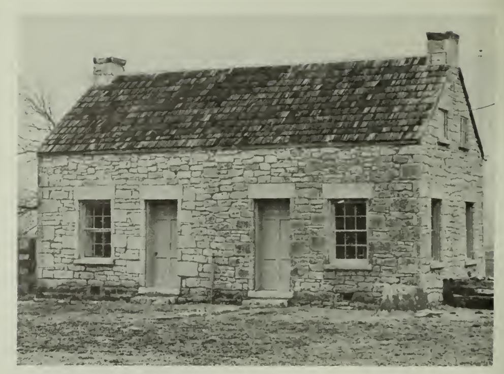
Copperas Cove Stagestop and Post Office, Copperas Cove vicinity, Texas, 1878. This fine example of vernacular stone construction in Texas is the only surviving structure from the original town of Copperas Cove. It served many functions, beginning as a stage relay station and post office.

Historically, governments have maintained control over postal systems, since the effective organization and control of society depend upon the ability to communicate. In America, the new United States Government also assumed control over mail service, but incorporated democratic principles by constitutionally placing the power to establish post offices and post roads in the hands of Congress. The establishment of postal service throughout the country provided an example of democracy at work: citizens petitioned Congress, which established post roads and instructed the Postmaster General to provide postal service along the routes. By 1820, the number of post offices and miles of post roads were approximately guadruple that of 1800. In addition to providing tangible reminders to otherwise isolated communities of the role and ideals of the central government, post offices, through their number, distribution, and types of services, represented many politically advantageous opportunities to Members of Congress. Using their franking privileges, Congressmen could widely and inexpensively distribute speeches and campaign materials, and they could also gain political support from the press by purchasing space for notices concerning postal business. Throughout the 19th and early 20th centuries,