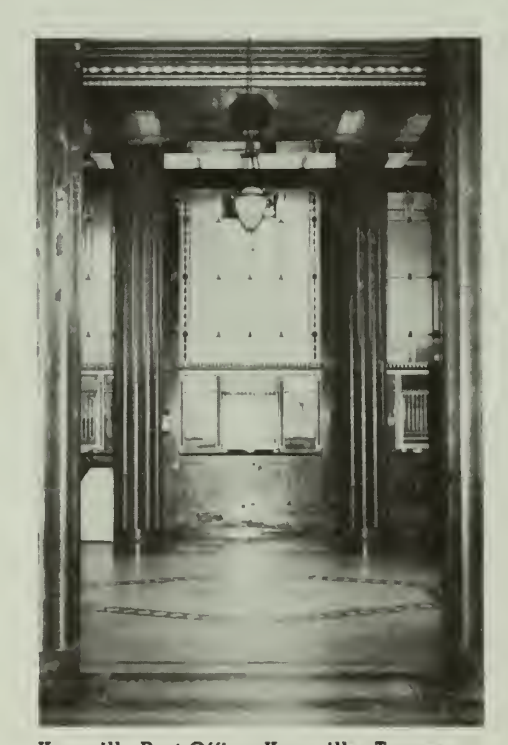
Knoxville Post Office, Knoxville, Tennessee, 1932-33. Sometimes the interior of a building may be as significant or more significant than its exterior. The Knoxville Post Office displays elaborate Art Deco detailing in its lobby, which is one of the most significant interior spaces in the city.

specific themes, the following list outlines general characteristics that might qualify post offices for listing in the National Register. These characteristics should be much more specific when applied to an individual post office. For example, the features that make it a good example of an architectural style, or the