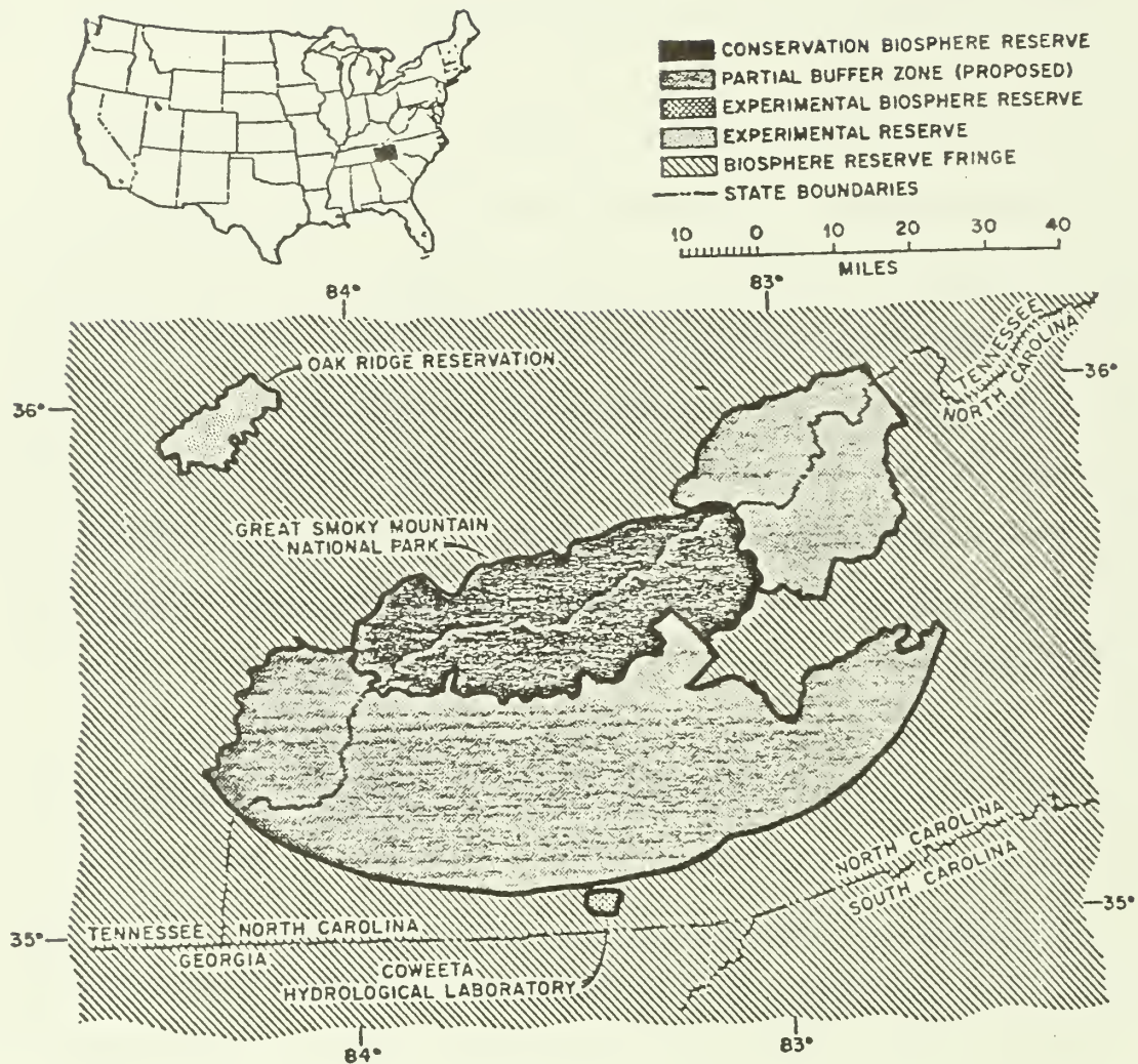
Figure 1. Southern Appalachian Region Biosphere "Reserve Cluster"