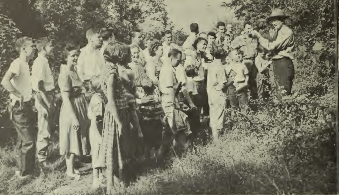
Forest life is discovered on Theodore Roosevelt Island

DAY CAMPS. Nature activities in D. C. Recreation Department Day Camps during the summer are conducted by Park Naturalists and camp leaders. Children wishing to attend these free camps may telephone the D. C. Recreation Department (ADams 4-2050) for information and applications.