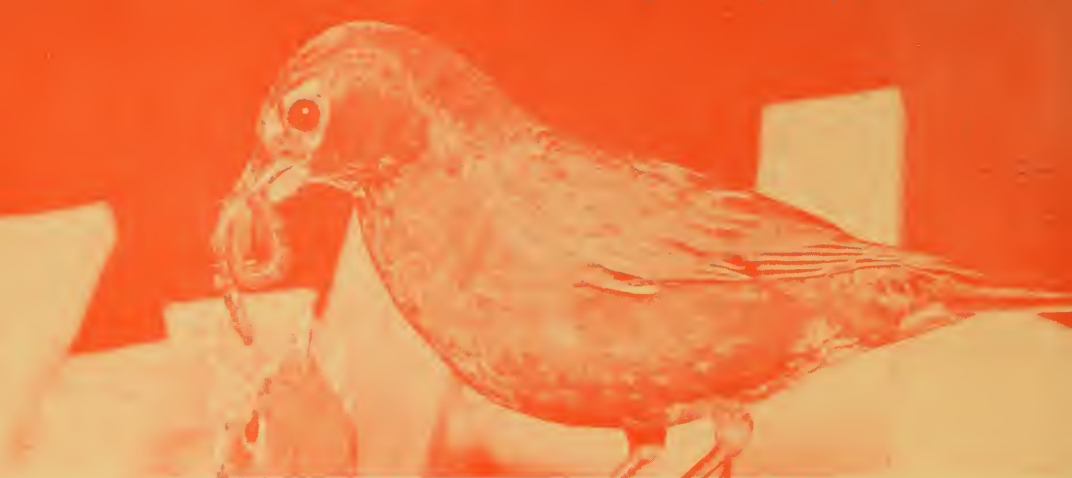
A robin feeds her young

July 4 BARGE TRIPS 2 and 4 p.m. See page 3. Wed.