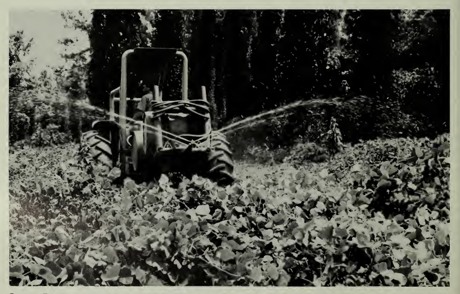
Figure 1. The tractor-sprayer treating the large research plots.