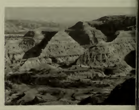
Theodore Roosevelt National Memorial Park

South Unit Visitor Center and the ranger station at the North Unit and accessible by wheelchair. The Maltes Cross Cabin, directly behind the visitor center, is accessible to 27-incle wide wheelchairs. Wheelchair visito have access to two campground three picnic areas, and about 12 scen overlooks. Nature trails are too stee for wheelchair use. Audiovisual prigrams are offered at the visitor center Interpretive talks and campfire prigrams are held at both campground