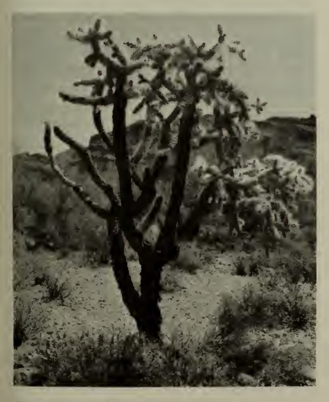
Organ Pipe Cactus

Average elevation: 3,200 feet. Oxygen is available. Nurse, doctor, and ambulance services are 5 miles away at Camp Verde. A hospital at Cottonwood is 20 miles away.