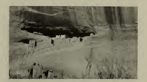
Canyon de Chelly

Elevation at visitor center: 5,500 feet. South Rim drive averages 7,000 feet. White House trail is much too strenu ous for persons with a breathing or coronary problem. Oxygen is available at the visitor center and at the Public Health Service at Chinle, 1 mile away.