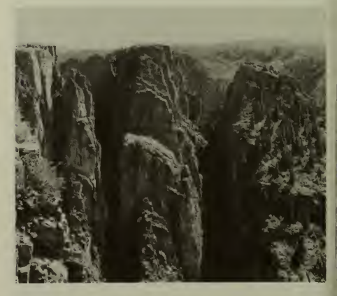
Black Canyon of the Gunnison

A wide ramp provides wheelchair access to the visitor center. All doors of this building are wide enough for a standard wheelchair. The restrooms have handrails. The fish ponds are also accessible. Elevation: 7,500 feet.