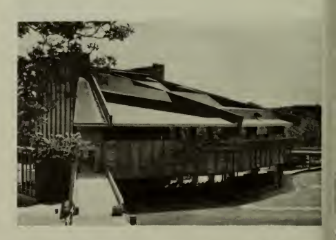
Wolt Trap Farm Park For The Performing Arts

Filene Center is not readily accessible to wheelchair visitors, but arrangements may be made at the box office for assistance in seating. Theater and box office area are adjacent to the roadway. An access ramp is provided from the unloading zone. Handicapped persons should go to the box office prior to the performance. Current visitor center and office buildings are inac cessible to wheelchair visitors. The theater may be viewed during the day from level walks.