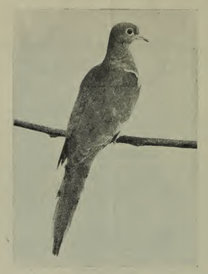
Figure 1.—The mourning dove is the only game bird that breeds in every State.