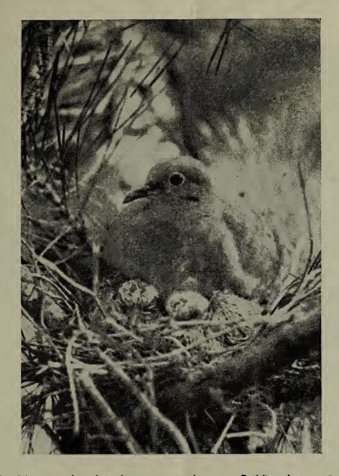
Figure 3.—Mourning dove brooding young in the nest. Building the nest, incubating the eggs, and caring for the squabs require a period slightly longer than one month.

Results of studies that have been made in North Carolina, Iowa,2 and in northeastern Texas all parallel the Alabama findings. 1941 at two banding points in North Carolina fledglings were banded in their nests as late as September 27 and October 4; over a 3-year period in Iowa 21.9 percent of the young left the nest after September 1, and 2.3 percent after October 1; and in Throckmorton County, Tex., young doves were observed to leave their nests as late as September 25.3 Similar data are available from other southern