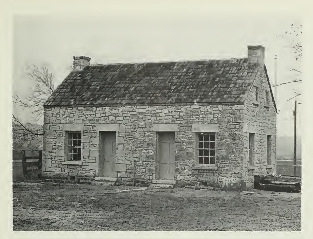
Copperas Cove Stagestop and Post Office, Copperas Cove vicinity, Texas, 1878. This fine example of vernacular stone construction in Texas is the only surviving structure from the original town of Copperas Cove. It served many functions, beginning as a stage relay station and post office.

companies. Postal savings banks were authorized in 1910 in order to encourage thrift, increase the amount of money in circulation, and provide security, especially for those without access to banks. They became particularly popular during the Great Depression of the 1930s, when the government inspired greater confidence than private financial institutions.