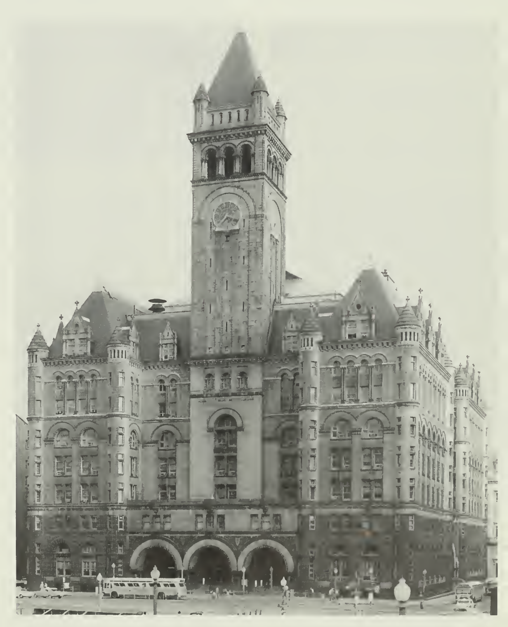
Old Post Office and Clock Tower, District of Columbia, 1891-99. One of Washington's few Romanesque Revival Buildings on a monumental scale, this was the city's third tallest building when completed, exceeded only by the Capitol and the Washington Monument. The Old Post Office was the first Federal building erected in the area now known as the Federal Triangle. It served as headquarters for every Postmaster General from 1899 to 1934. (William Edmund Barrett)

Post offices are important examples of this type of property. In order to facilitate the evaluation and nomination of post offices, the National Park Service conducted a study of various factors in the establishment, role, and design of post offices in order to establish a consistent policy for applying the National Register Criteria for Evaluation to these buildings. The study focused on the history of post offices prior to 1939 to accommodate the impact of major Federal programs of the Depression. The following guidance for evaluating the significance of post offices using the National Register Criteria resulted from this study. This second edition of National Register Bulletin 13 also looks at post offices built after World War II. This publication is intended to assist anyone in the evaluation of the eligibility of post offices for inclusion in the National Register, and to suggest an appropriate approach for evaluating other similar resources.