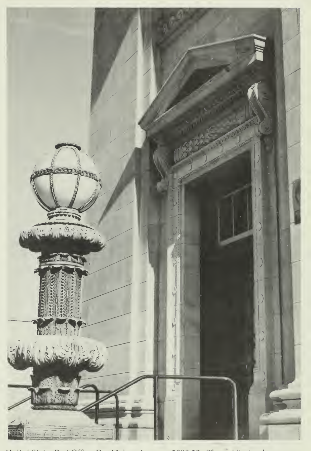
United States Post Office, Des Moines, Iowa, ca. 1908-12. The architectural significance of a building is often illustrated through a collection of rich detailing. This doorway and acanthus leaf lantern are part of a post office that is one of the best examples of classical architecture in central lowa. (John H. Wetherell)

In some cases, a single quality or association under one of the criteria and the retention of the most important quality of integrity may be sufficient to demonstrate that the post office is eligible for the National Register. When the quality or qualities of significance, or the significance of themes, are weaker, however, a combination of characteristics may be necessary to justify eligibility. In marginal cases, it is necessary to compare the post office's qualities of significance and integrity to those of other properties within the same themes to decide which property or properties best represent the significant themes. The post office may or may not surface as the best or one of the best examples of a theme. In some cases, a survey conducted to identify these properties for comparison may reveal a related group of post offices, or post offices and other properties, all of which meet National Register Criteria. If the post office is the only identified property in its theme, that will strengthen the case for listing in the National Register, but there may be instances where a post office that is the only surviving representative of an important theme fails to possess a strong enough justification of significance or sufficient integrity to meet National Register Criteria. If a post office is determined not to be individually eligible for the National Register, it may still be eligible as part of an historic district that qualifies for listing.15