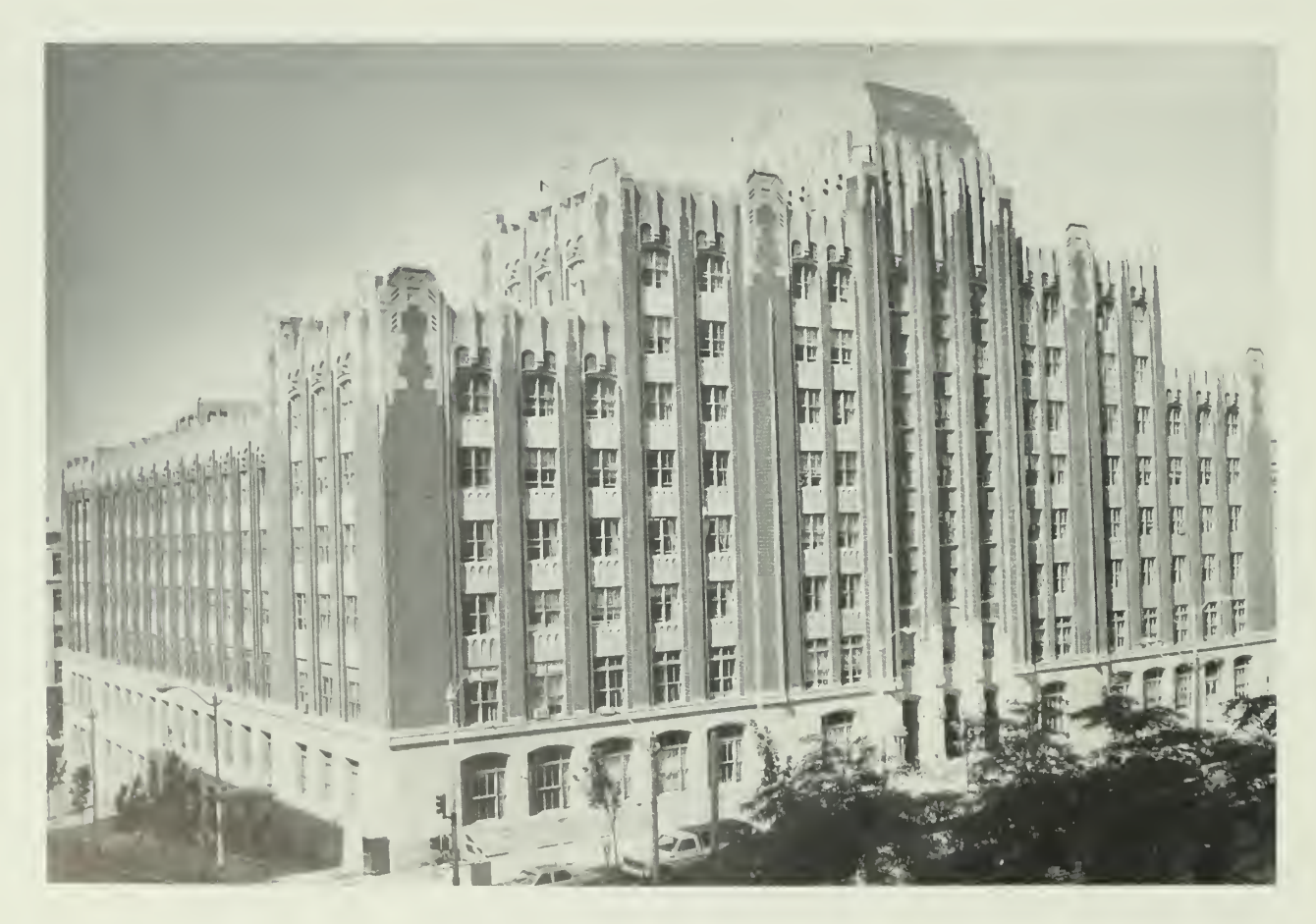
Federal Office Building, Seattle, Washington, 1932-33. In addition to being the city's first building designed especially for Federal offices, this was one of the first Modernistic-styled buildings designed by the Office of the Supervising Architect of the Treasury Department. The innovative use of cast aluminum spandrel panels beneath the windows was the first extensive use of aluminum on the West Coast. Much of the interior Art Deco ornamentation remains intact. (John Kvapil)

government programs supporting graphic arts during the Depression, the Treasury Department's Section of Painting and Sculpture (later the Section of Fine Arts) was the principal sponsor of art for Federal buildings, primarily post offices. Funds for artwork were based on 1% of the total appropriation for the building's construction. Unlike another major program, the Works Progress Administration's Federal Art Project, the Section's program was one of patronage rather than relief and stressed quality over mass production. Artists were selected through blind competitions, whose standards encouraged realism as the most appropriate style and scenes of everyday American life as suitable subjects. Placement of the commissioned murals and sculptures in public buildings resulted from the desire of leaders in the Administration to make original, quality art accessible to those who otherwise had little or no opportunity to see it. Local reactions to the newly installed works