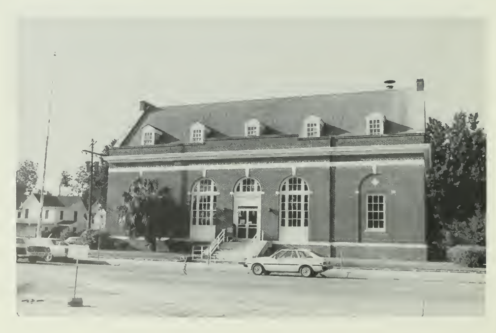
Jennings Post Office, Jennings, Louisiana, 1915. Representing a degree of stylistic sophistication unexpected in a small town in rural Louisiana as early as 1915, the Jennings Post Office is noted for its progressive design in a commercial center otherwise characterized by more modest vernacular buildings.