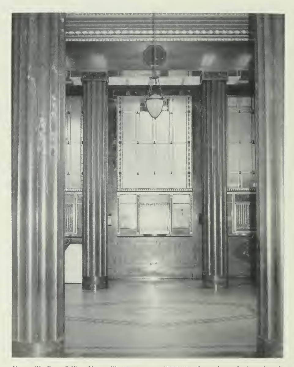
Knoxville Post Office, Knoxville, Tennessee, 1932-33. Sometimes the interior of a building may be as significant or more significant than its exterior. The Knoxville Post Office displays elaborate Art Deco detailing in its lobby, which is one of the most significant interior spaces in the city. (Thomason and Associates)