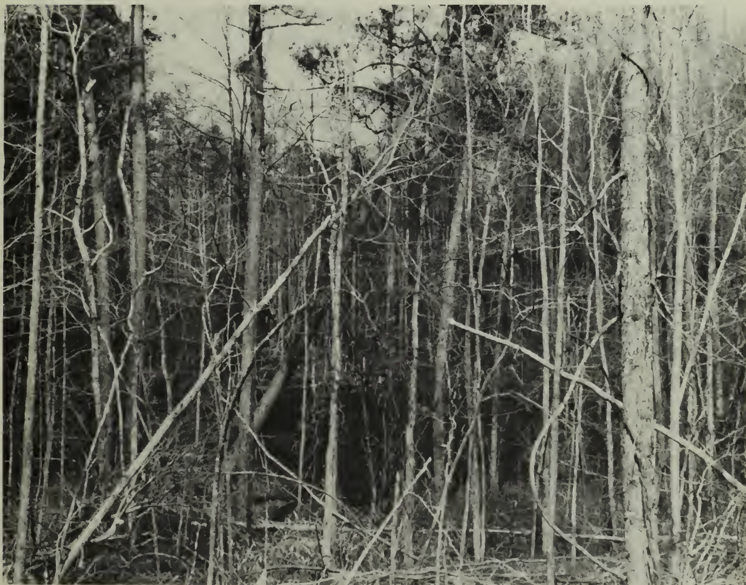
Standing residuals ranged to over 30 tons per acre on conventionally harvested areas.