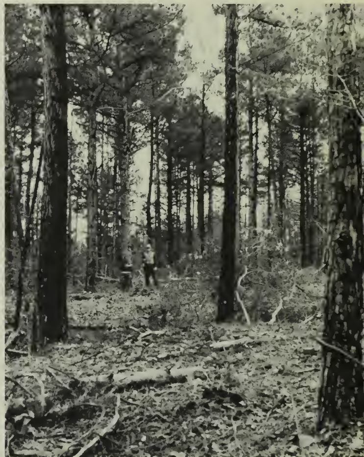
Park-like conditions after whole-tree harvesting of all material except pine sawtimber.

Our residual prediction equation should be used only for the range of tonnages, percentages of hardwoods, and product mix included in our study. The predictions would not hold, for example, if hardwood saw logs were not removed. Our results indicate, however, that prediction equations can be developed for additional conditions by using the theoretical uncut trees as the independent variable.