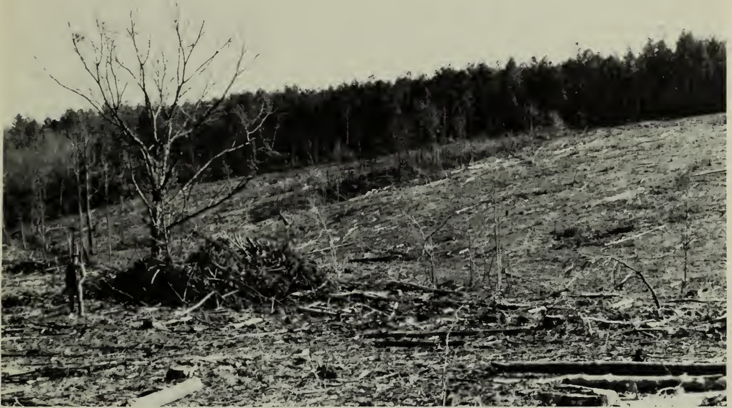
Whole-tree-harvest areas were virtually free of debris except for scattered limb piles.

In most logging operations large quantities of wood are left on the site in tops of cut trees and in unmerchantable standing trees. These residues represent a wasted resource and they hinder site preparation and the planting of a new stand. To deal with residues in a systematic way, a manager must know the quantity and type of material that will be left before an existing stand is harvested. The results reported here show that residue quantities can be predicted with reasonable accuracy prior to harvesting. If whole-tree chippers are used, the study also demonstrates the overwhelming advantage of chipping small trees before the larger, more valuable timber is harvested.